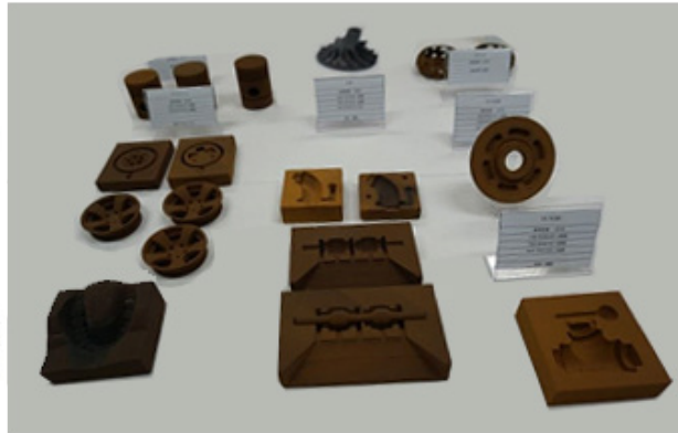
Sample components produced with next generation sand printer utilizing flexible printer settings to optimize and reduce the volume of sand required, minimizing production time and cost.