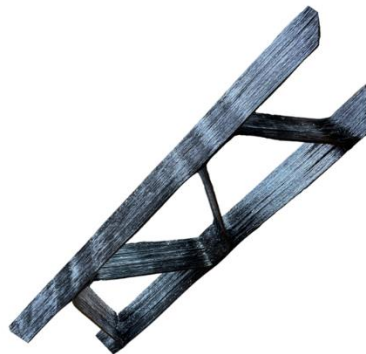
Figure 2: Carry-through structural member prototype taking into account manufacturing constraints of continuous fiber additive manufacturing.