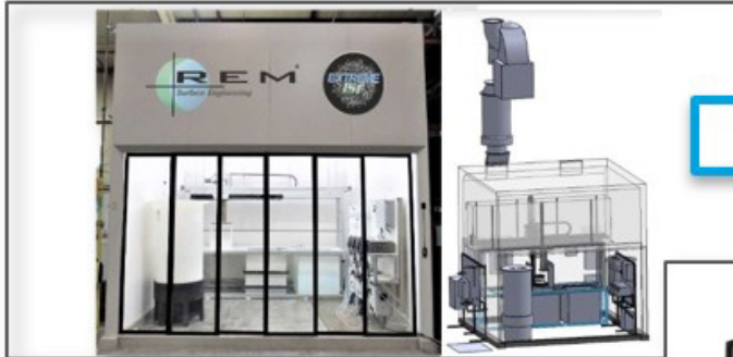
Current processing cell – 30" x 30" x 24" max capability